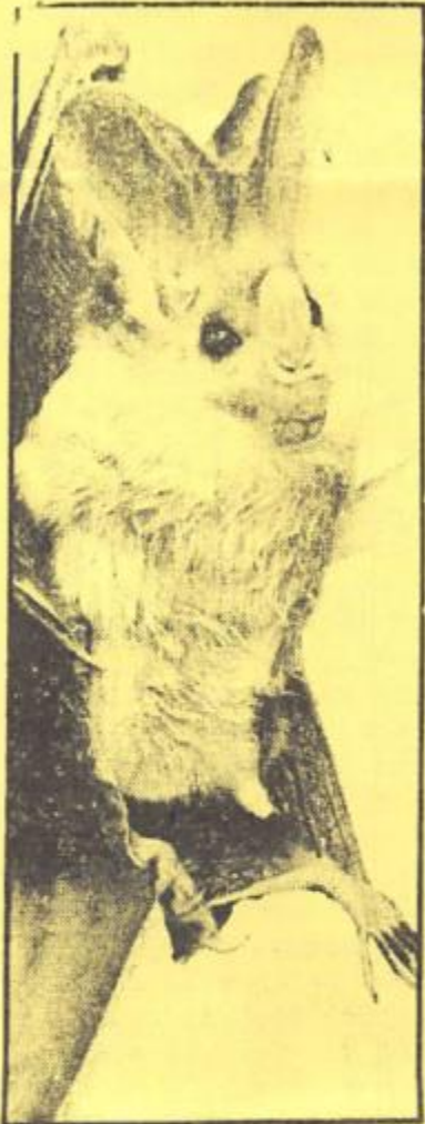
ONE of the ghost bats which are under threat.

• FUTURE generations will condemn government and industry that wantonly destroy our fragile planet.